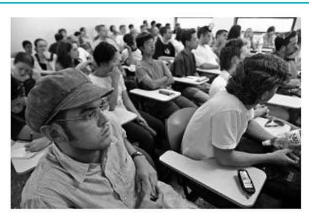
WHERE DO WE GO FROM HERE?