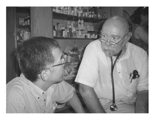
The author (left) and a Dutch doctor at an orphanage in Haiti

etc., seems to be the unconscious role that the university plays. I believe this unconscious role taken by the university is an asset that the university has in its history.