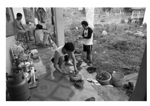
Japanese and Vietnamese staff cooking during field activities in Vietnam

where more than two hundred thousand people were estimated to have died and one million people lost their homes and access to safe water and sanitation a couple of months ago. There were uncountable numbers of patients with severe injuries who were thus seeking health care including surgical operations. The medical services provided by the Japan Disaster Relief Team were appreciated by the Haitian people.