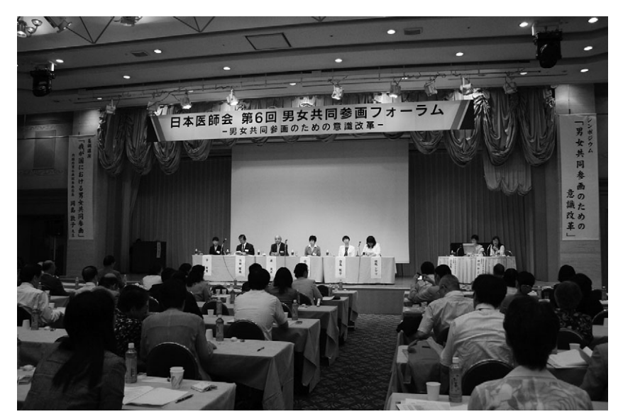
Fig. 3 The national conference in Kagoshima 2010

1900. Currently, 521 of 1,429 doctors and 25% of our faculties are female in the university including the hospital and medical facilities. The percentage of women doctors is quite large compared with other medical universities in Japan. Over the years the university has learned what is necessary to provide support and currently runs two main support centers for women doctors, (1) Support Center for Women Health Care Professionals and Researchers, and (2) Professional Reentry Support Center for Women Physicians. The Support Center for Women Health Care