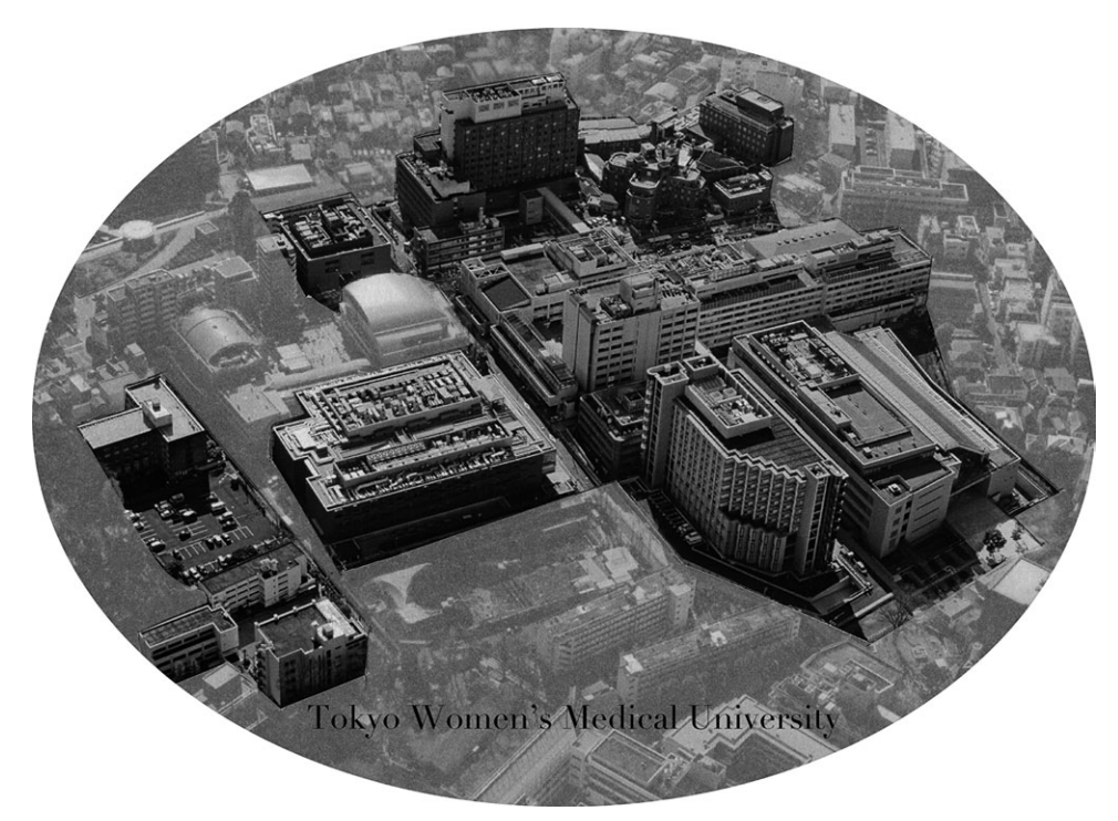
Fig. 4 Tokyo Women's Medical University

stances of the applicant are taken into consideration such as specialty, experience and lifestyle, so that the chosen hospital, the applicant and the center combine to create a custom-made training curriculum. We also provide a hands-on training course of endoscopic and echographic examination. Over three years, 117 women doctors applied to the center for reentry training and 93 had practical training in the hospitals. The major hospitals accepting re-trainees are our university hospital, Japan Red Cross Society Hospitals and the Saiseikai Hospital Group. Applicants even outside Tokyo can receive training. The other program is e-learning for studying up-to-date clinical medicine. The contents include learning experience from women doctors who received training. The e-learning assists applicants in practical training. Enrollment in e-learning currently is about 2,600. We received the Minister of Education, Culture, Sports, Science & Technology Prize in the 2010 e-learning competition.