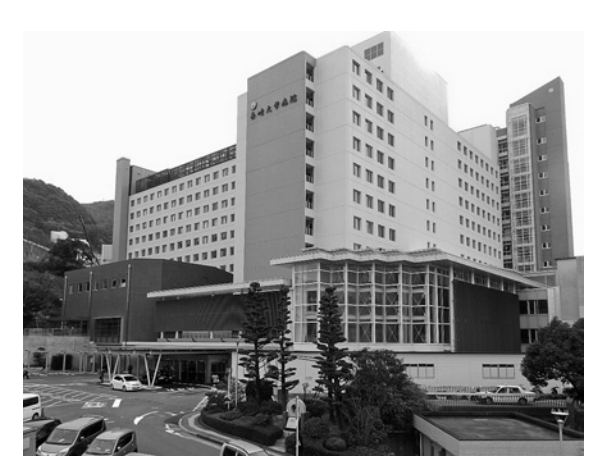
Nagasaki University Hospital

hospitals had already been formed 10 years before the NUMA, and since that time there had been great demand for the establishment of an association such as NUMA. Thanks to the efforts of the directors of Nagasaki Medical Association—who were employed at the University— NUMA was formed with the support of the Nagasaki City Medical Association, to which the majority of the physicians practicing at Nagasaki University Hospital had belonged to up until this point. Currently, NUMA has 793 members, including physicians from a wide range of diagnosis and treatment departments at NUSM, Nagasaki University Hospital, and physicians affiliated with NUSM's research laboratories. Residents and other young physicians also participate actively in the NUMA.