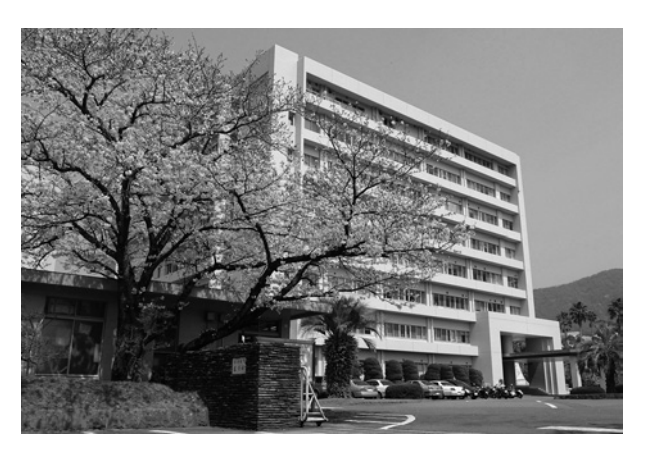
Basic Medical Science Building

We sincerely hope to promote the understanding of NUMA's activities among young and motivated physicians, strengthen the cooperation with prefectural and city medical associations, and contribute to the greater good of society.