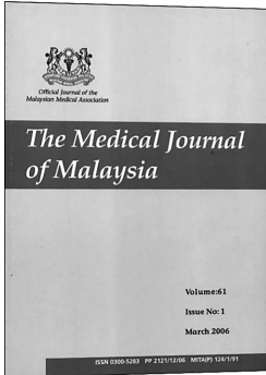
The Medical Journal of Malaysia