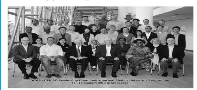
January 14-18, 2013

Attended the WMA Leadership Course at the INSEAD Institute in Singapore January 13-18, 2013