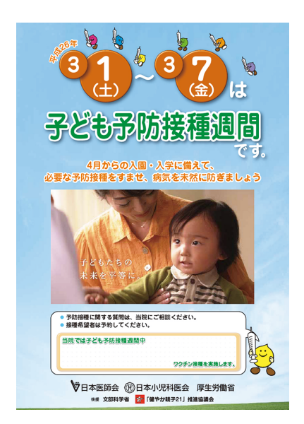
Photo 1 Poster to promote vaccination among children "Child Vaccination Week March 1 to 7" from JMA, MHLW and Japan Pediatric Association

patients with anti-influenza drugs virtually within 48 hours of onset.